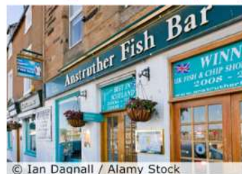
Running a fish and chip shop