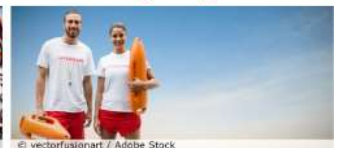
Being a lifeguard