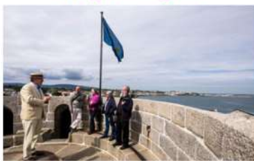
Being a tour guide