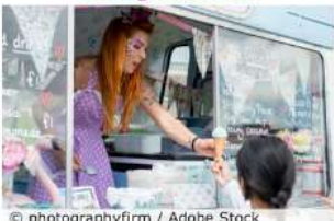
Selling ice cream