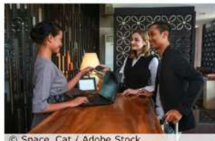
Running a hotel