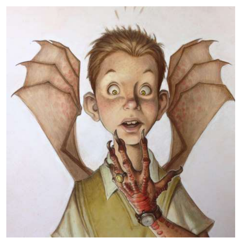
In the thought bubble write what the boy could be thinking.